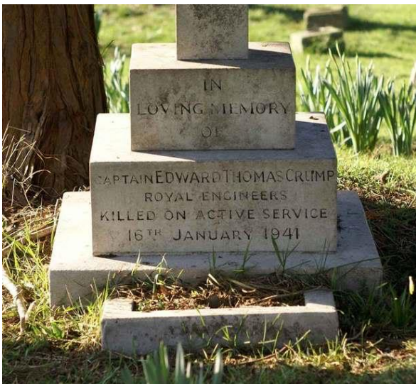
Dunton Bassett Graveyard

His body was brought back from London and rested in the Village Church overnight covered with a Union Jack. The funeral took place the next day and interment in Dunton Bassett Churchyard.