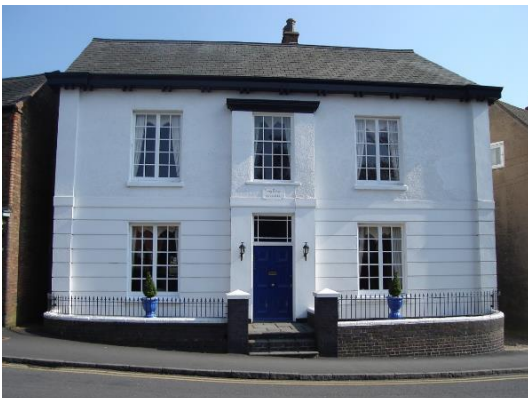
Tong Lodge, Church Street