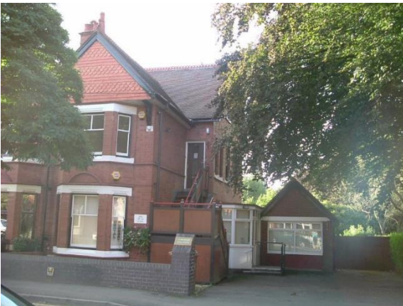
23 Mount Road, Hinckley